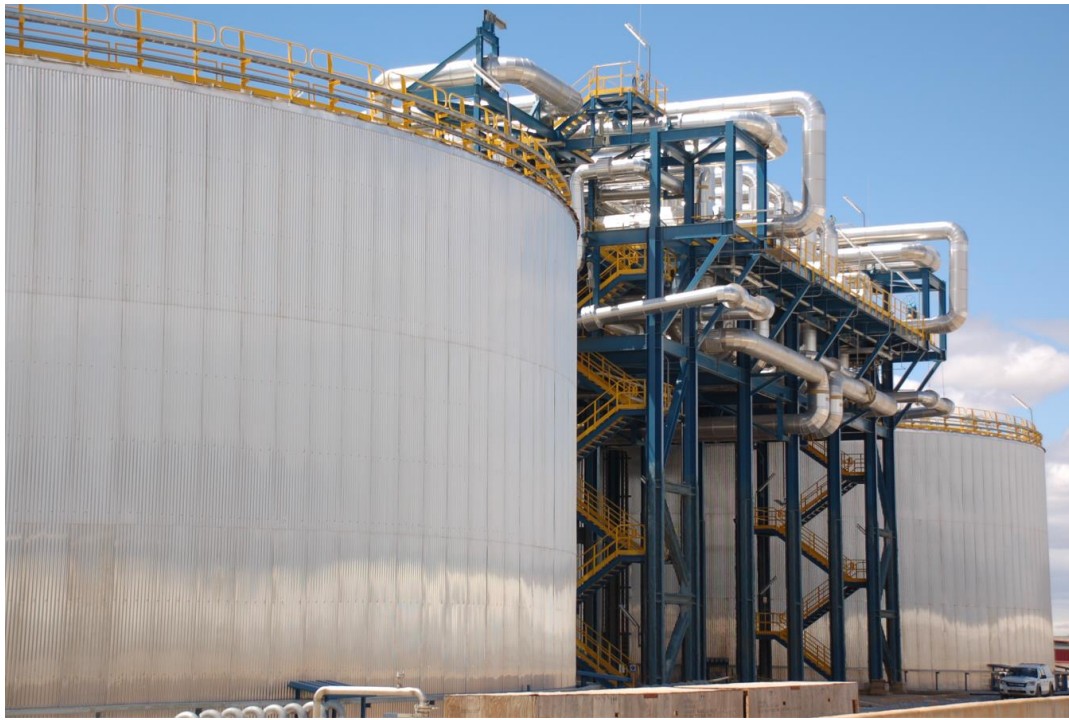
Figure 2: Liquid salt storage in a solar thermal power plant